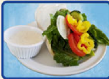
Chicken Salad or Chicken Breast Sandwich