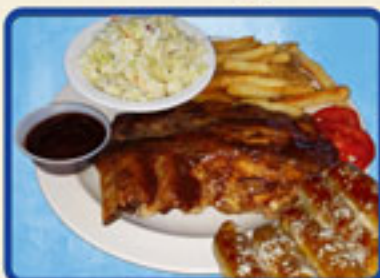
Smoked Baby Back Pork Ribs