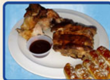
Chicken & Ribs