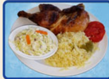
Chicken Combo Platter