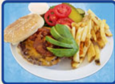
1/3 lb. Avocado & Bacon Cheeseburger