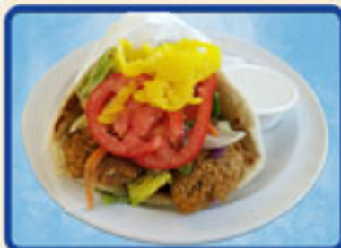
Falafel Sandwich or Veggie Sandwich