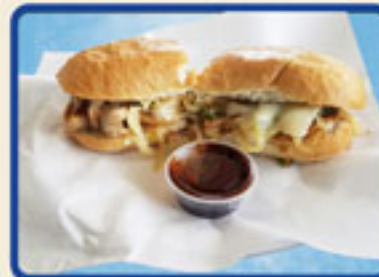
Beef or Chicken Philly Sandwich