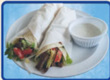
Chicken or Beef Wrap