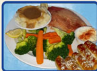
Catch of the Day