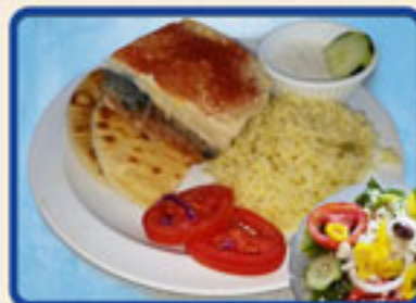
Moussaka or Pastitsio